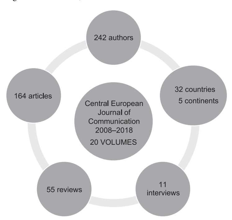
Figure 1. Central European Journal of Communication in numbers (2008–2018)

Thanks to you we are proud to summarise the first 10 years of the publishing of the CEJC with the following numbers; in the period of 2008–2018, a total of 164 articles written by 242 authors from 32 different countries were published. This includes the number of book reviews and interviews with experts in related media fields (see Figure 1 and Table 1).